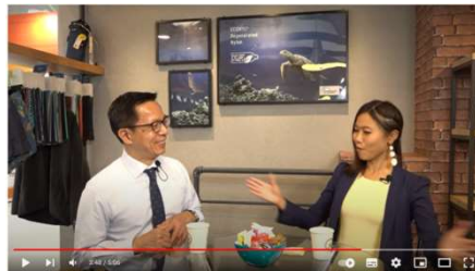
TITAS 2020 LIVE STREAM | HO YU TEXTILE CO., LTD. 觀看次數：44,800次 · 上傳日期：2020年10月13日