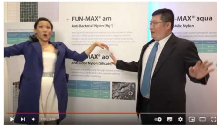
TITAS 2020 LIVE STREAM | CHAIN YARN CO., LTD. 觀看次數：148,000次 · 上傳日期：2020年10月13日

On-site Tour Video Videos help reach a wider Market