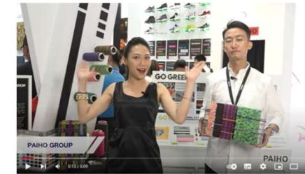
TITAS 2020 LIVE STREAM | PAIHO GROUP 觀看次數：23,784次 · 上傳日期：2020年10月13日