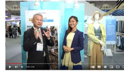
TITAS 2020 LIVE STREAM | NEW WIDE GROUP 觀看次數：25,300次 · 上傳日期：2020年10月13日